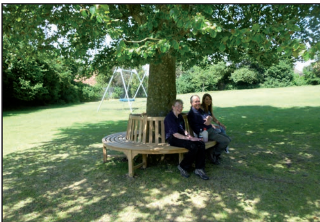
New tree seat in Green Meadow

Since this is likely to be the most costly phase of the project and the Parish Council has limited funds available to allocate to it, grant aid will need to be sought. Companies offering such funding require proof that what they will be helping provide is something that is required and will benefit the community, usually involving some