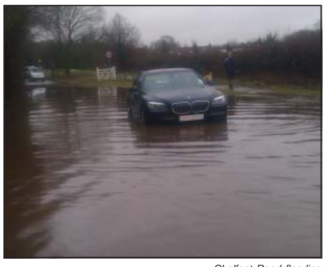
Chalfont Road flooding

Following the January Parish Council meeting a letter was sent to Bucks County Council (BCC) Transport Service Leaders to ask what could be done to alleviate this ongoing problem. In