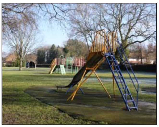
Green Meadow Play Area

If you wish to help or know of funding sources please contact our Parish Clerk on 01494 874233 or by email: clerk@seergreenparishcouncil.gov.uk