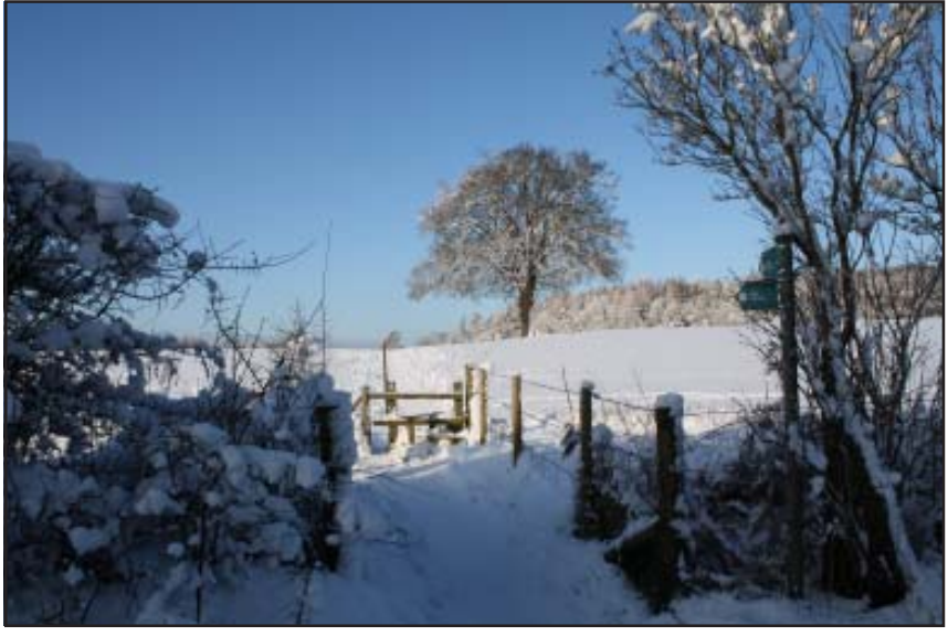
Footpath view from Bottom Lane

The SGPC Jubilee Trail (see our web site for details or call our Clerk for a copy of the map) gives the family, couple or individual the opportunity of following the routes that past villagers trod to see friends, take produce to market or