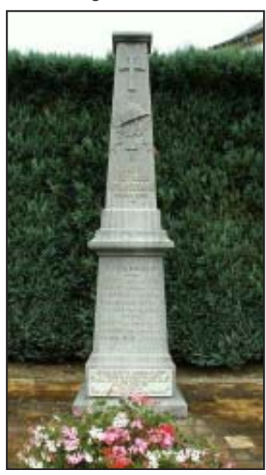
An example of a village war memorial

Anyone with information about those from the village who died serving their country in wars and who do not feature on these plaques should contact Councillor Dennis Scourfield at the address below, as should any possible donors (Gravs Cottage, Church Road, Seer Green, telephone 01494 672167).