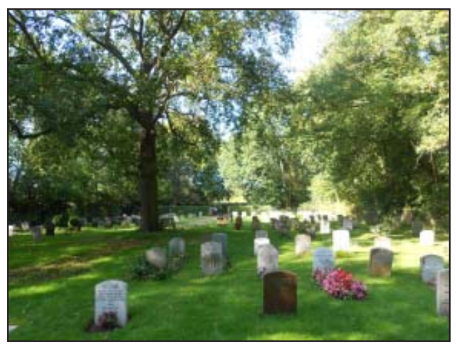
Seer Green Cemetery

Both were refused by Chiltern District Council. The second application went to appeal and was also dismissed by the Department of the Environment. The cemetery is now over three quarters full and space is at a premium as there are no further plans to extend the cemetery. At the July Parish Council meeting it was agreed to re-landscape some areas to provide more burial plots. It was agreed to remove the raised flower bed at the rear of the cemetery, to demolish the rear wall and to remove paving slabs at the rear of the oak tree. The area cleared by this work will be used to provide full burial plots.