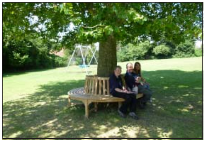
New tree seat in Green Meadow

Since this is likely to be the most costly phase of the project and the Parish Council has limited funds available to allocate to it, grant aid will need to be sought. Companies offering such funding require proof that what they will be helping provide is something that is required and will benefit the community, usually involving some