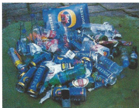
Rubbish recently discarded by Youths drinking in Green Meadow

The Parish Council would appreciate any written comments in favour or against having a designation order. If against, please state the reasons why you are against this proposal. Comments received will be discussed at a Parish Council meeting and forwarded to the authorities who decide whether a designation order will be made.