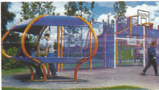
Sample of Youth Shelter and Ball Wall

PC McVeigh, PCSO Webb and members of the Youth Club attended an open session of a Parish Council meeting to outline their ideas for a Youth Shelter or perhaps a Sports Facility. It is anticipated that such a facility would provide a focal point for youth activities and go some way to meeting a need that is currently not well catered for within the village. It is hoped that this in turn would lead to less anti-social behaviour.