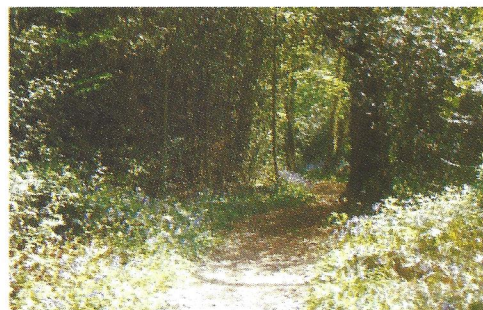
Spring 2006 Bluebells in Green Wood

Green Wood continues to be well cared for. Village footpaths are maintained to a good standard, bearing in mind that only modest funds are available from Bucks CC each year for maintenance.